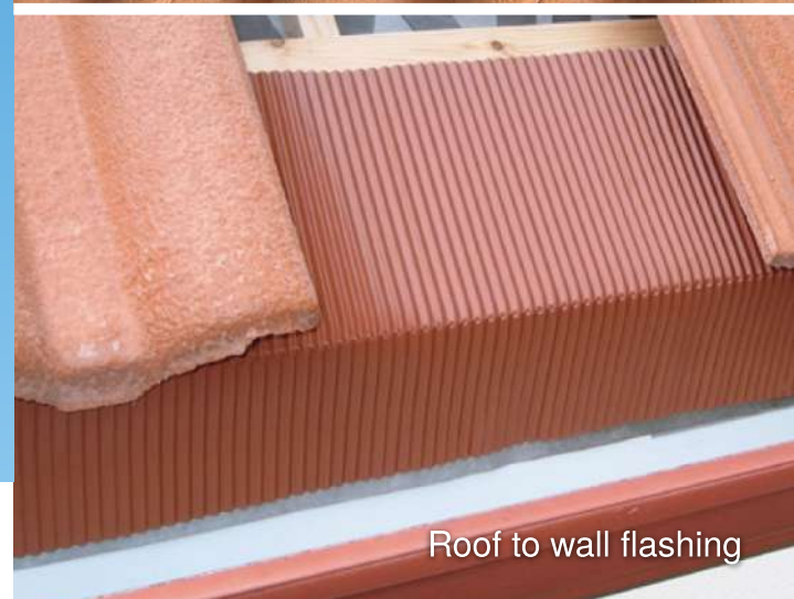
Roof to wall flashing